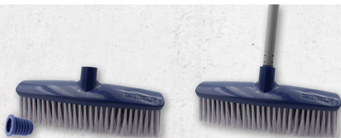
J208730 with Adaptor